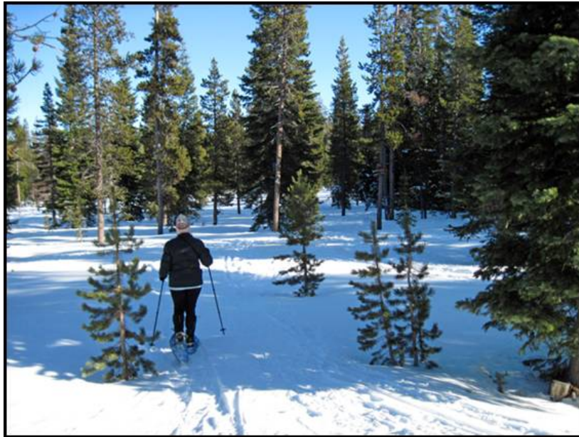
Two miles into the Long Loop.