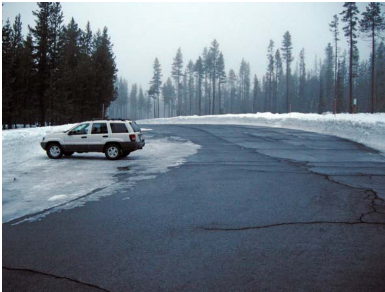
This is only half the available parking at the trailhead.