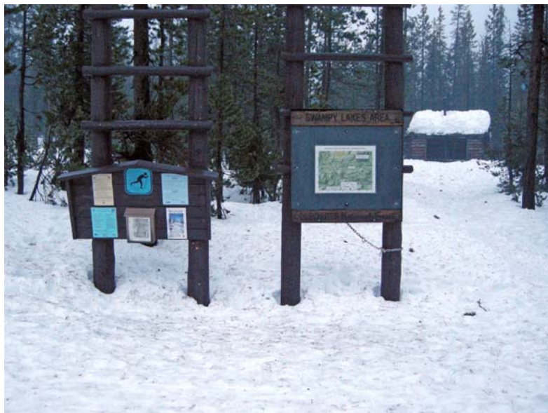
There is a warming hut at the trailhead – restrooms too!!! No Starbucks however.